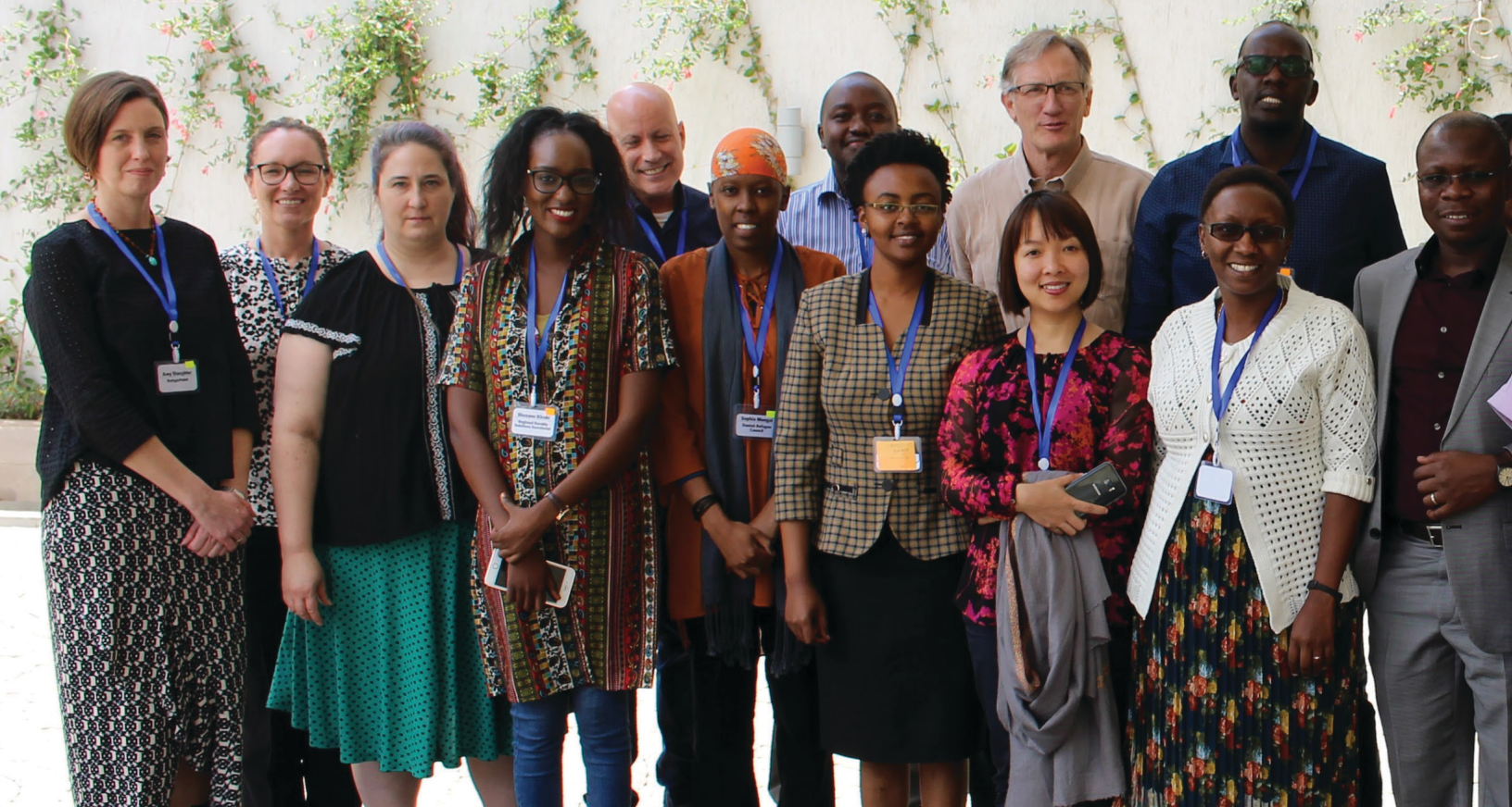
Participants of the Measuring Refugee Self-Reliance convening (March 20-22) in Nairobi, Kenya, pose for a group photo. Participation included 25 representatives from 15 organizations, including Trickle Up, UNHCR, Mercy Corps, IKEA Foundation, University of Oxford, International Rescue Committee, Danish Refugee Council, West Asia North Africa (WANA) Institute