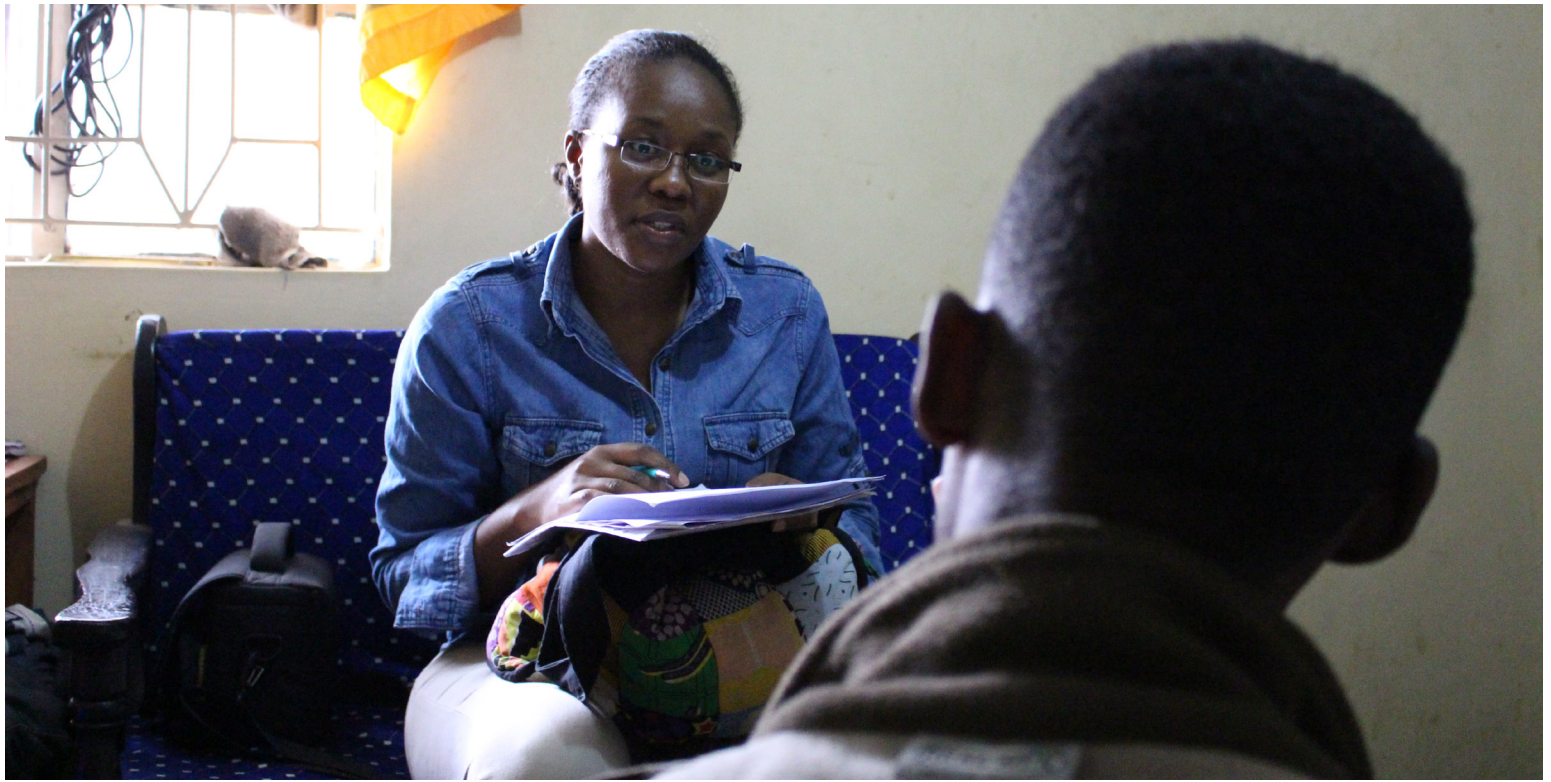
A RefugePoint Social Worker interviews a new client who has hopes of being resettled to the U.S.